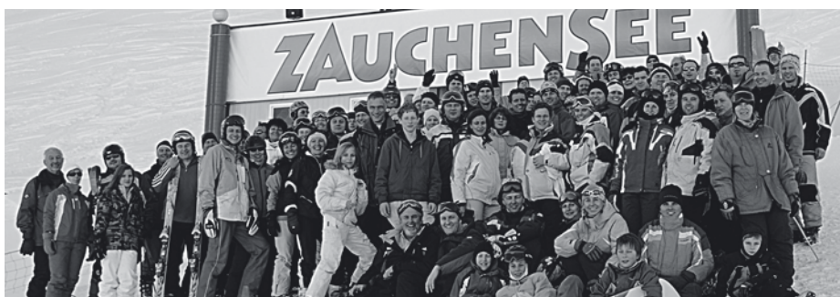
January Zauchensee, Austria.

What's June without a blizzard? Working in 20-inch snow, on a remote road in Montana's Glacier National Park, Hayward Baker was not deterred. Its task was to densify the soils along the sloping edge of the road by injecting compaction grouting to a depth of 30 feet at some 350 locations, enabling the road to be used in safety.